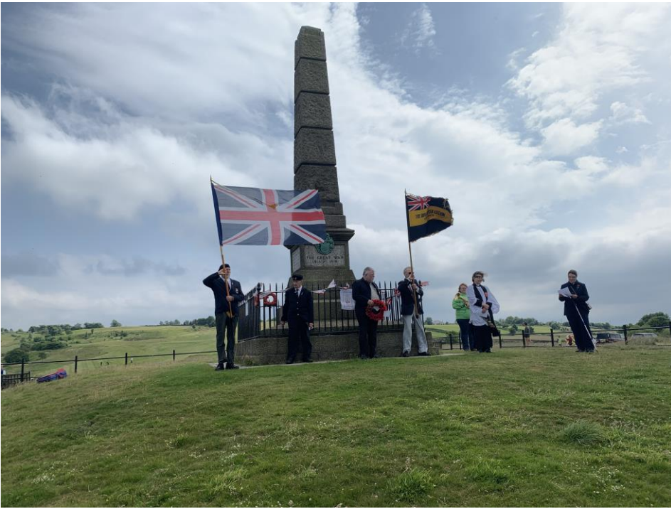
Peace Day at Werneth Low